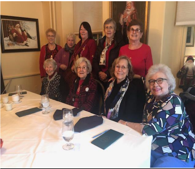
Fine Arts Christmas Luncheon