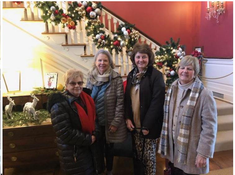
Cultural Arts trip to the Governor's Mansion, Harrisburg

Several of our branch interest groups enjoyed festive meetings in December. If you haven't been participating in our current interest groups take a look at the upcoming activities of the groups. We are also open to new ideas for interest group activities that interest our members. I hope some of you can join us for these activities. Let the group contact know if you need help to get to the group activities. The group contact can let other group members know if you need a ride.